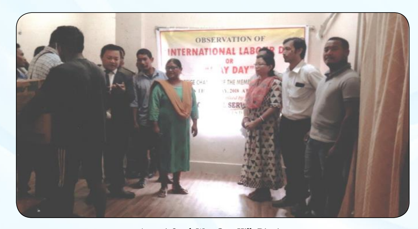
Ampati, South West Garo Hills District