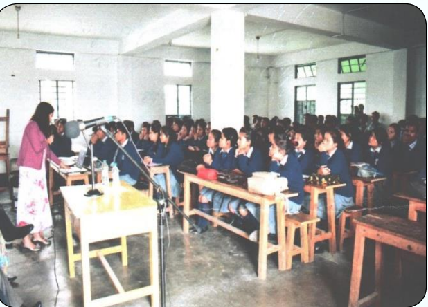
Sngap Syiem College, Mawkyrwat, South West Khasi Hills District