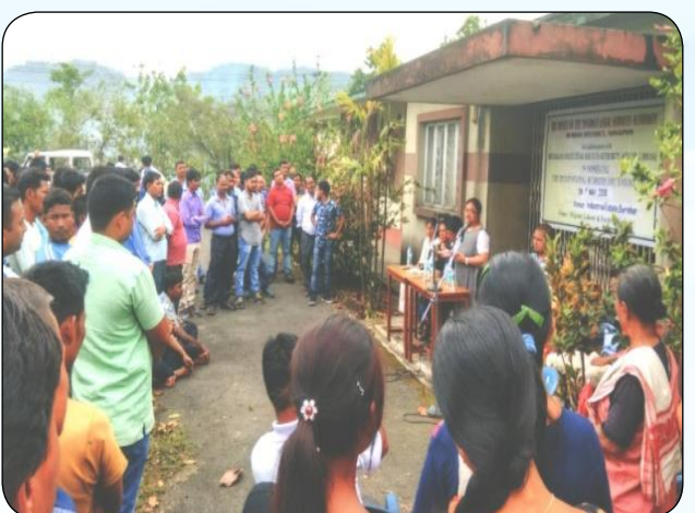
Industrial Estate, Byrnihat, Ri Bhoi District