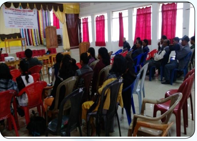
Multi-Purpose Hall, Deputy Commissioner's office Complex, Mawkyrwat, South West Khasi Hills District