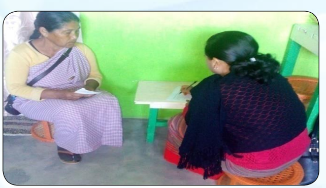
West Jaintia Hills District, Jowai