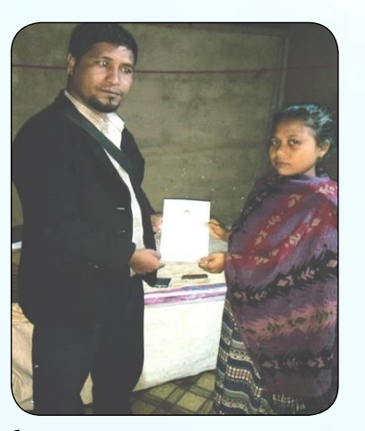
Ri Bhoi District, Nongpoh