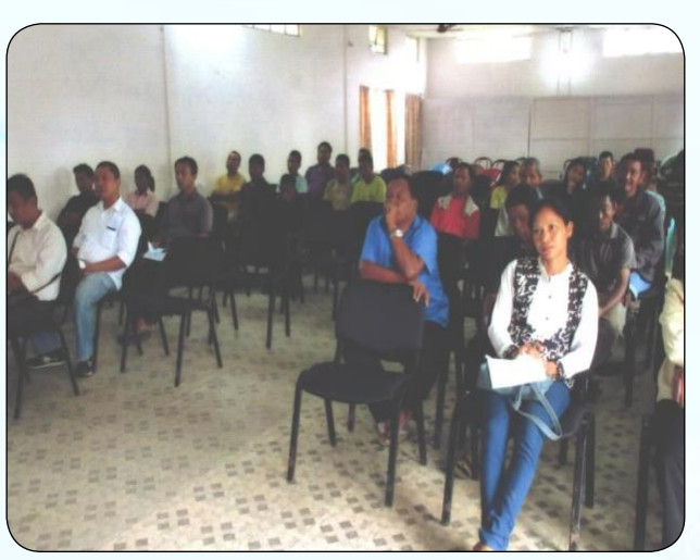
DRDA Hall, Baghmara, South Garo Hills District