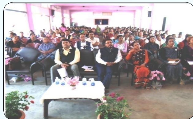
Sajer Community Hall, Nongpoh, Ri Bhoi District