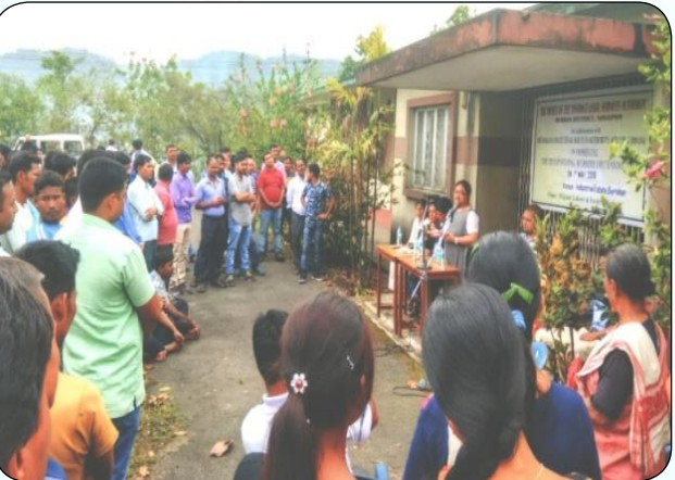
District Labour Office, Williamnagar, East Garo Hills District