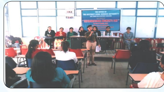
Shillong Law College, Shillong, East Khasi Hills District