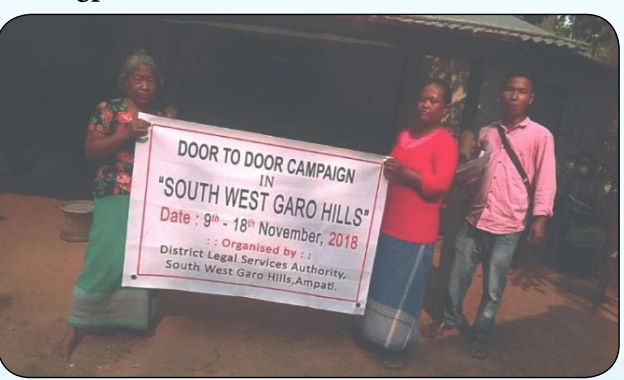
South West Garo Hills District, Ampati