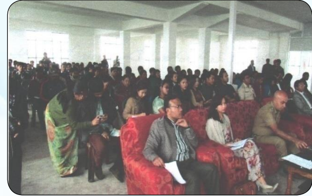
Sngap Syiem College, Mawkyrwat, South West Khasi Hills District