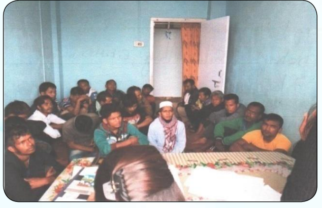
Shillong District Jail, East Khasi Hills District on the 7-5-2018