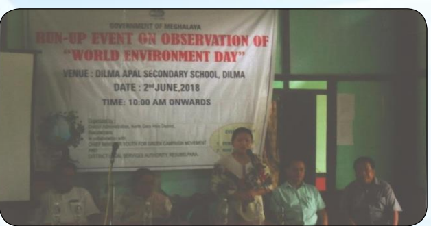
Dilma Apal Secondary School, Dilma, North Garo Hills District