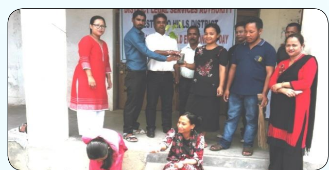
Tura, West Garo Hills District