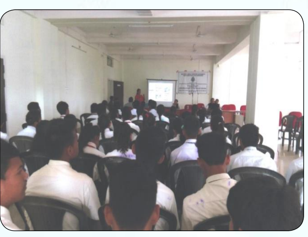
Williamnagar, East Garo Hills District