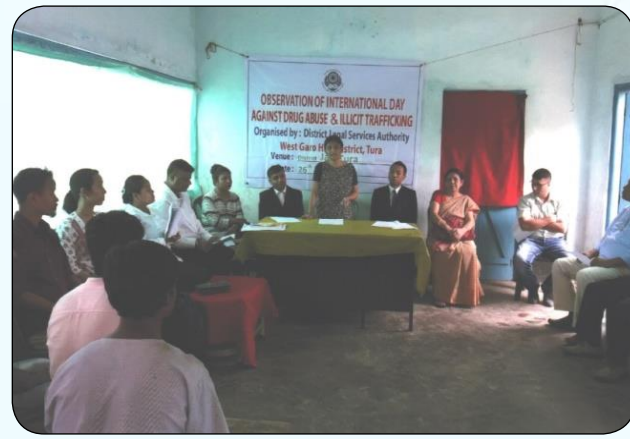
District Jail, Tura, West Garo Hills District