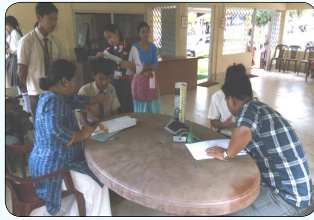
DRDA Hall No. 1, Williamnagar, East Garo Hills District